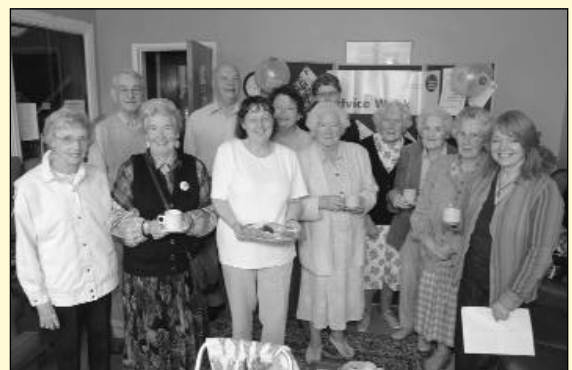
Staff, Committee Members and clients from Larne District CAB at the Coffee Morning held to celebrate Advice Week