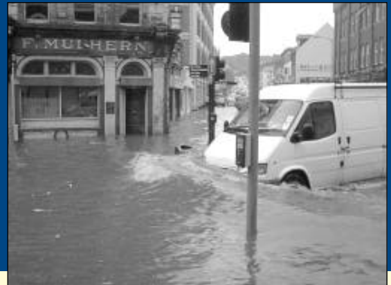
Extent of flooding in Derry City Centre